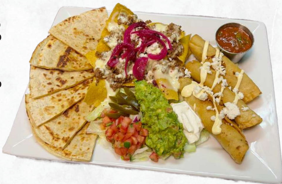
NO WEY JOSE PLATTER

PICK ONE: CARNITAS, STEAK OR SHREDDED CHICKEN, MAYO, CHEESE, LETTUCE, TOMATOES, JALAPENO, ONION, AVOCADO SLICES. SERVED WITH FRENCH FRIES.