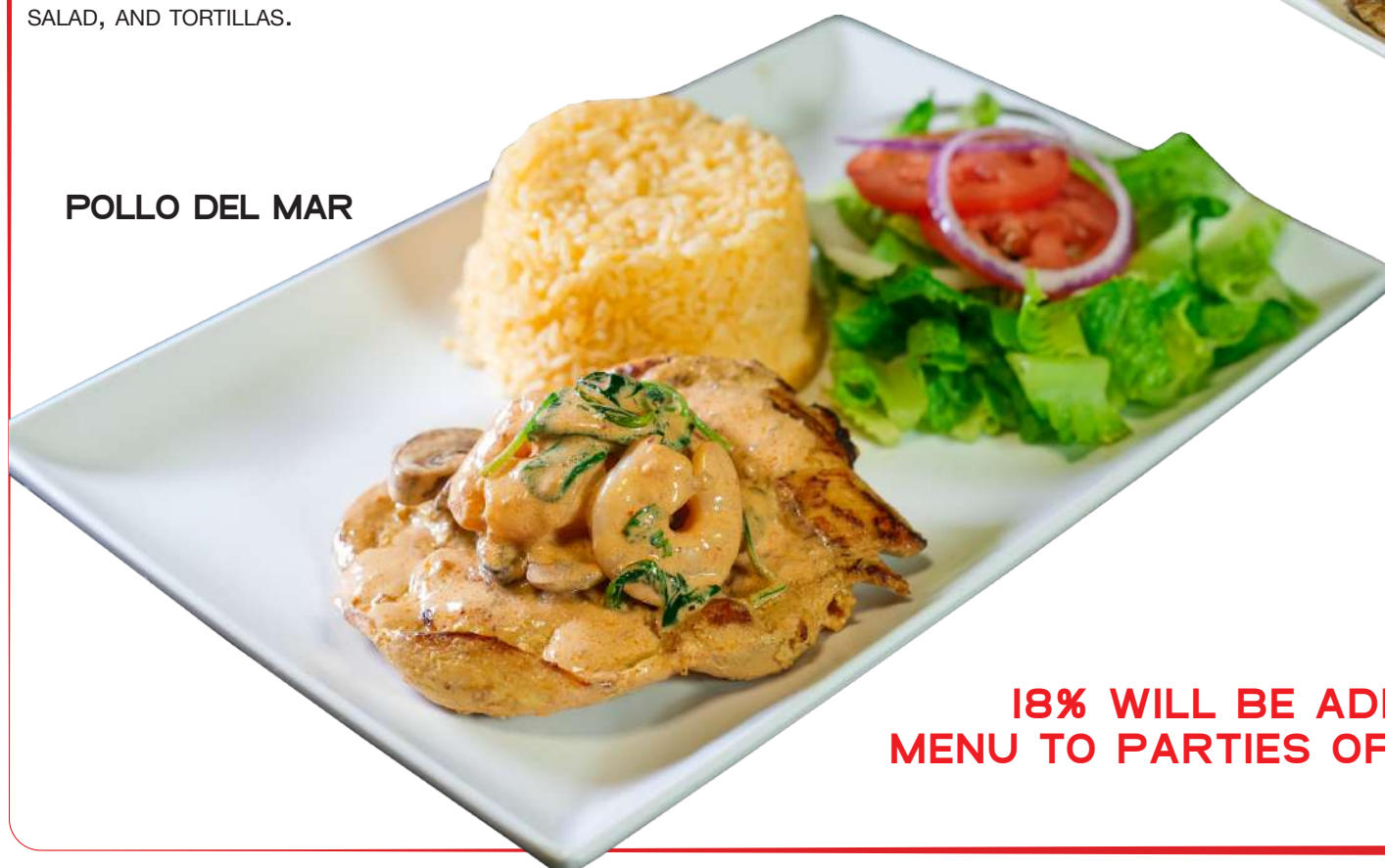
POLLO DEL MAR

18% WILL BE ADDED TO MENU TO PARTIES OF 6 OR MORE