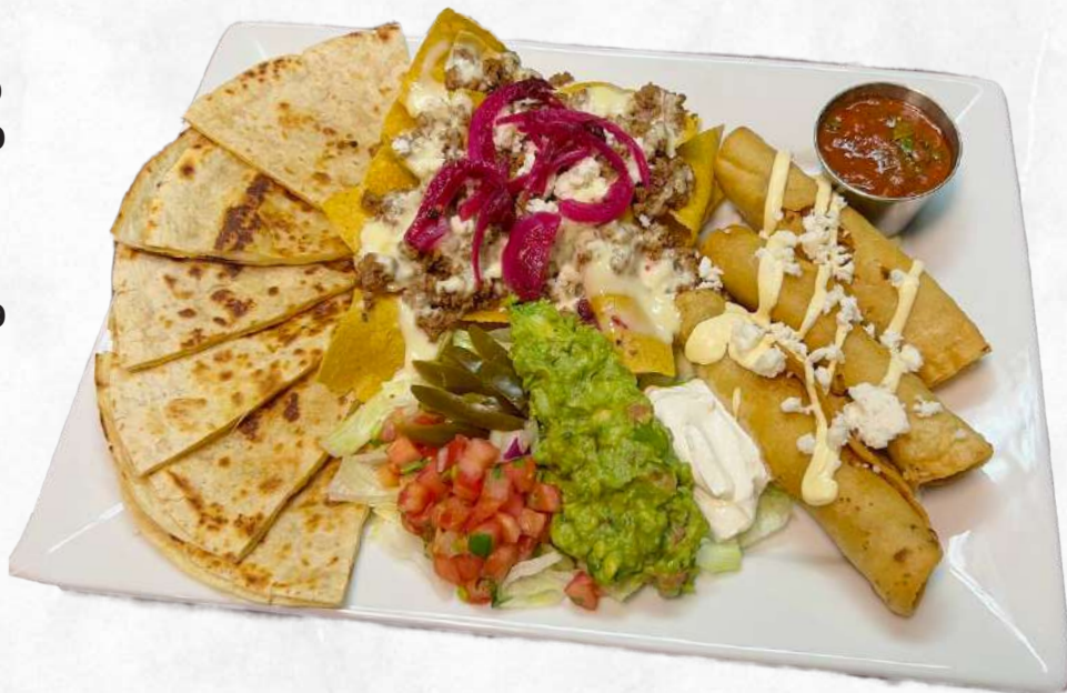
NO WEY JOSE PLATTER

PICK ONE: CARNITAS, STEAK OR SHREDDED CHICKEN, MAYO, CHEESE, LETTUCE, TOMATOES, JALAPENO, ONION, AVOCADO SLICES. SERVED WITH FRENCH FRIES.